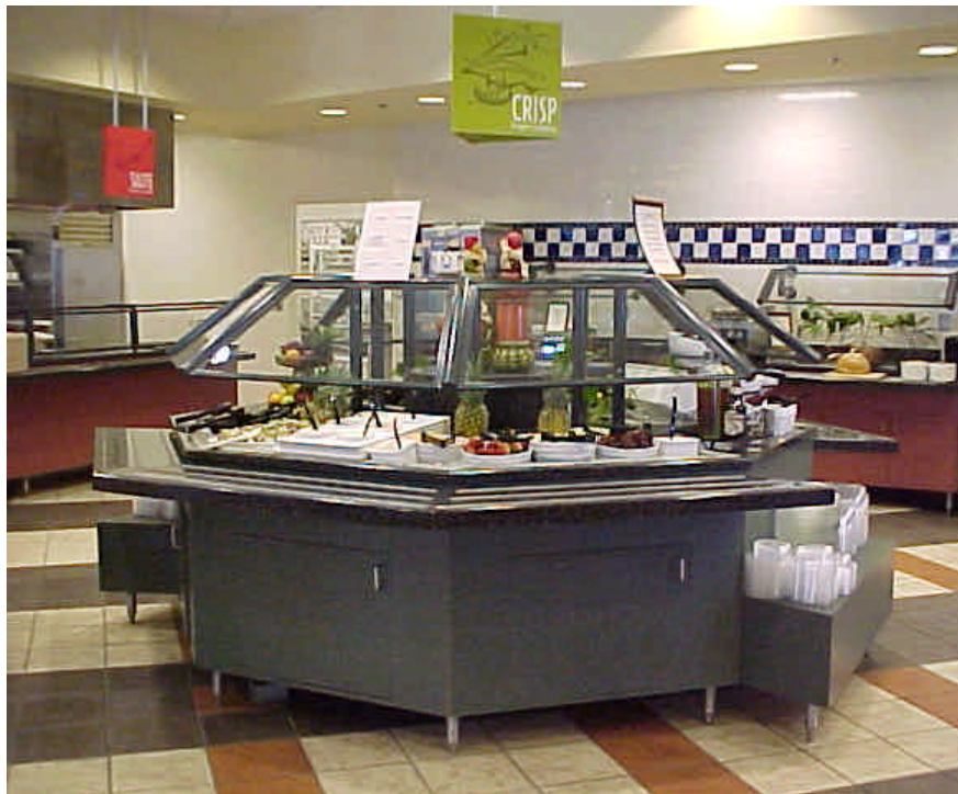
Octagonal Salad Bar