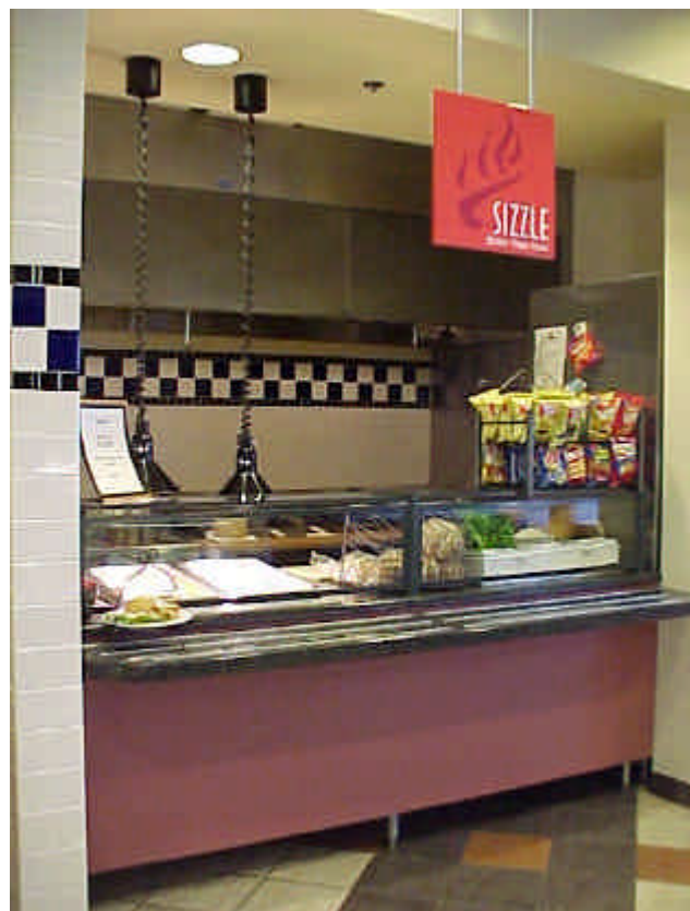
Sauté & Grill Station