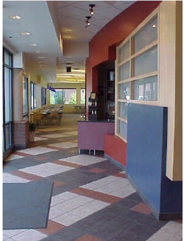
Dining Entrance & Coffee Bar