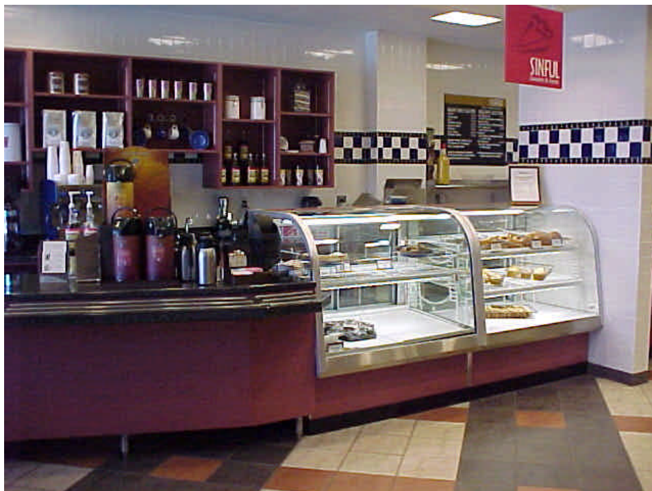
Coffee & Dessert